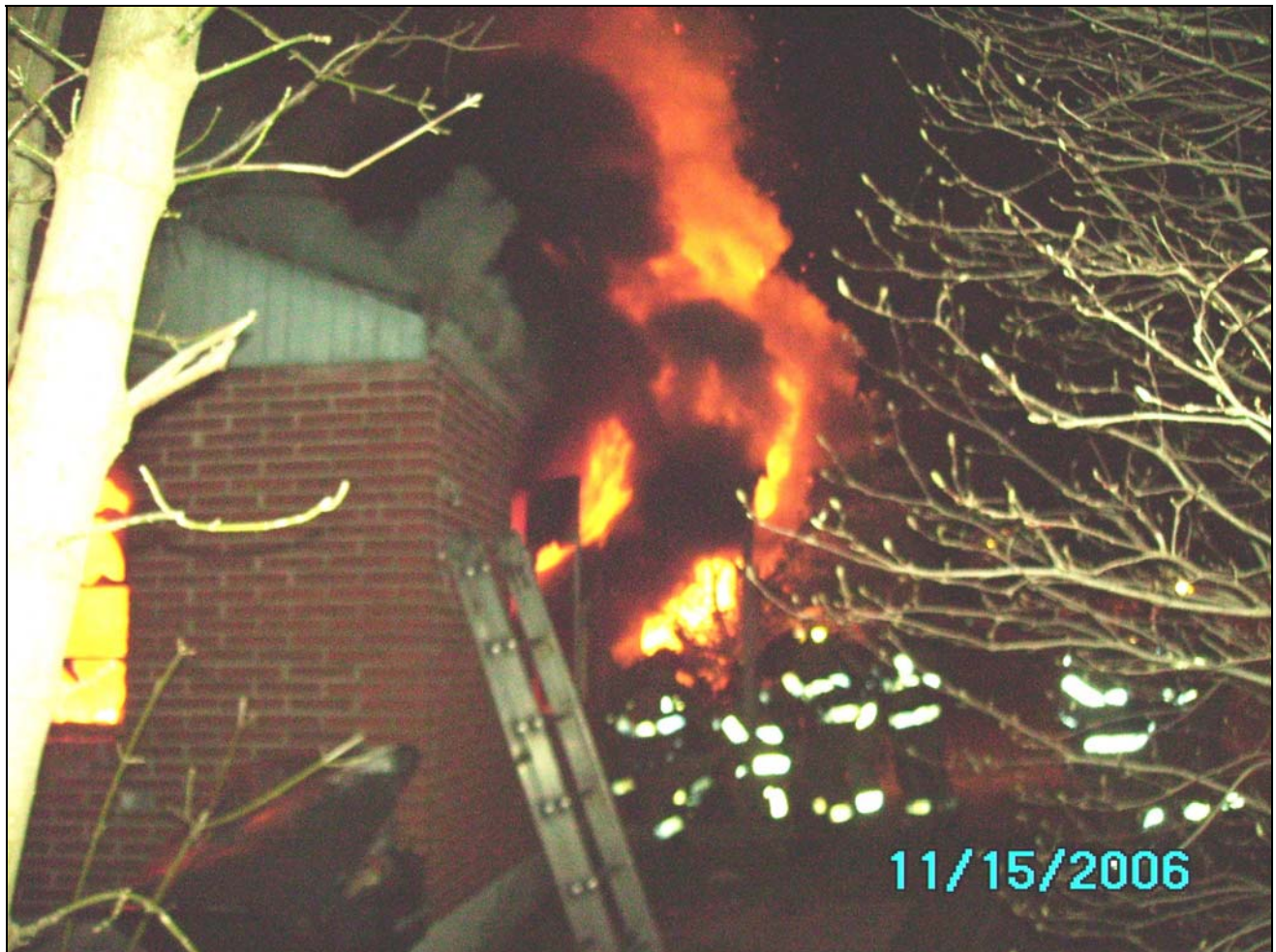
Photo 4. Fire fighter activities at front entrance during the incident. (Photo has incorrect date stamp.)