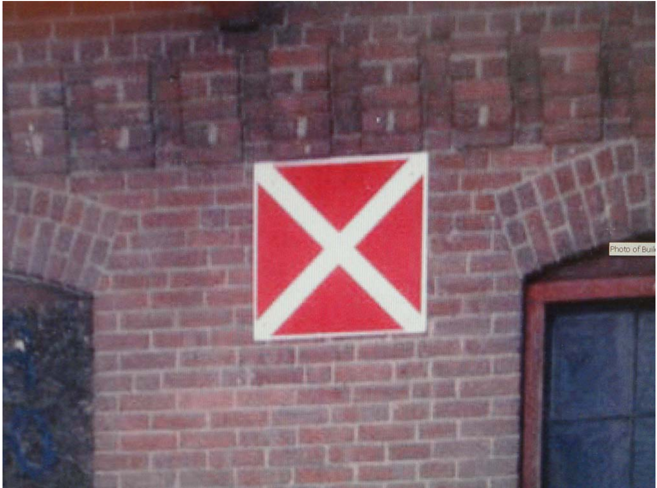
Photo 5. Warning placard for exterior operations preferable – enter only for a known life hazard. (The sign is 2ft x 2ft and is printed on corrugated plastic sign stock.)