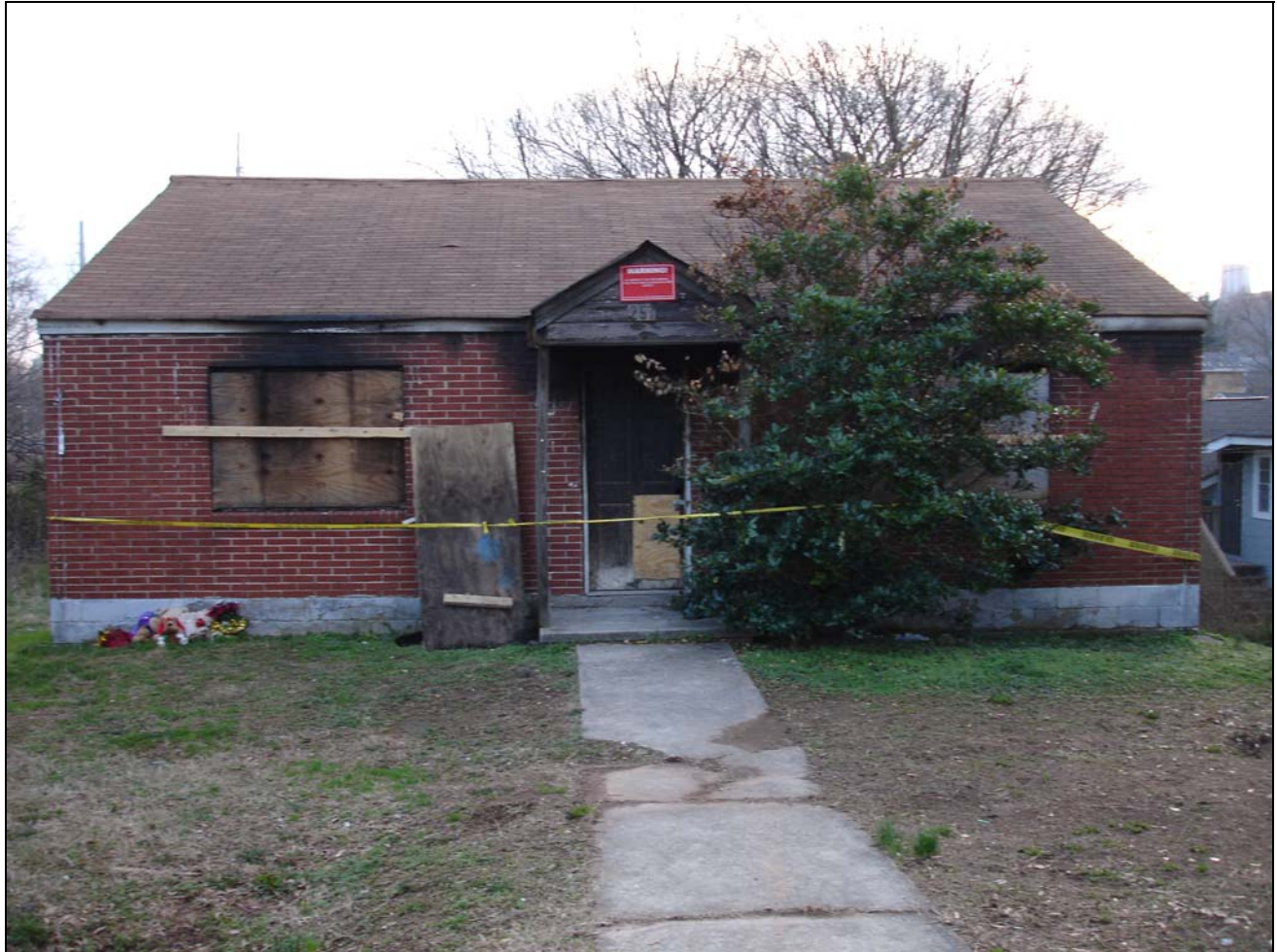
Photo 1. Front (A-side) of incident structure. (Placard placed after the fire above the front entrance says “Warning! By order of the Fire Marshall this structure is dangerous and unsafe”).