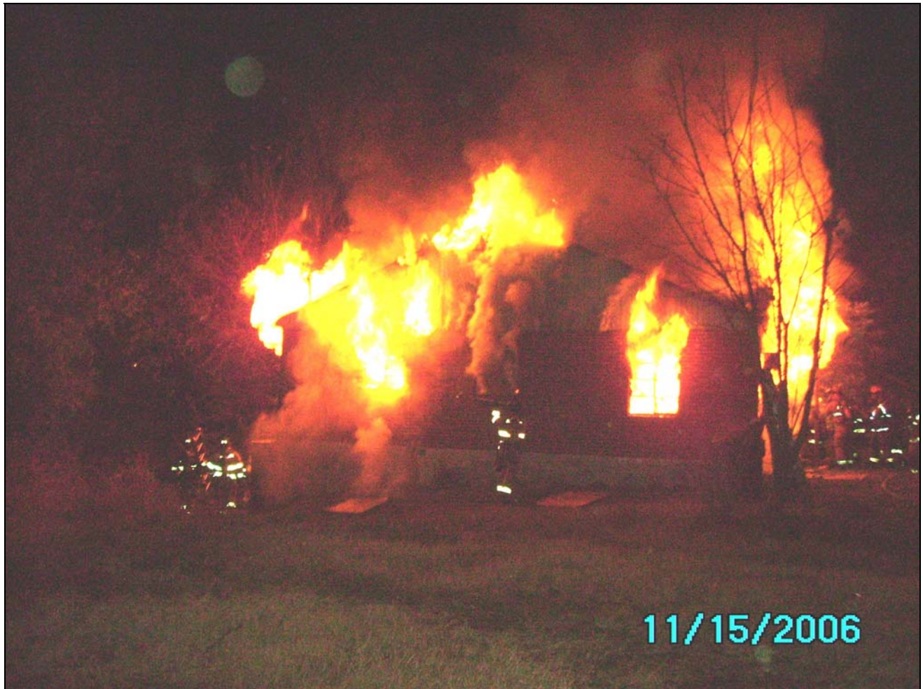
Photo 3. Fire conditions during the incident. (Photo has incorrect date stamp.)